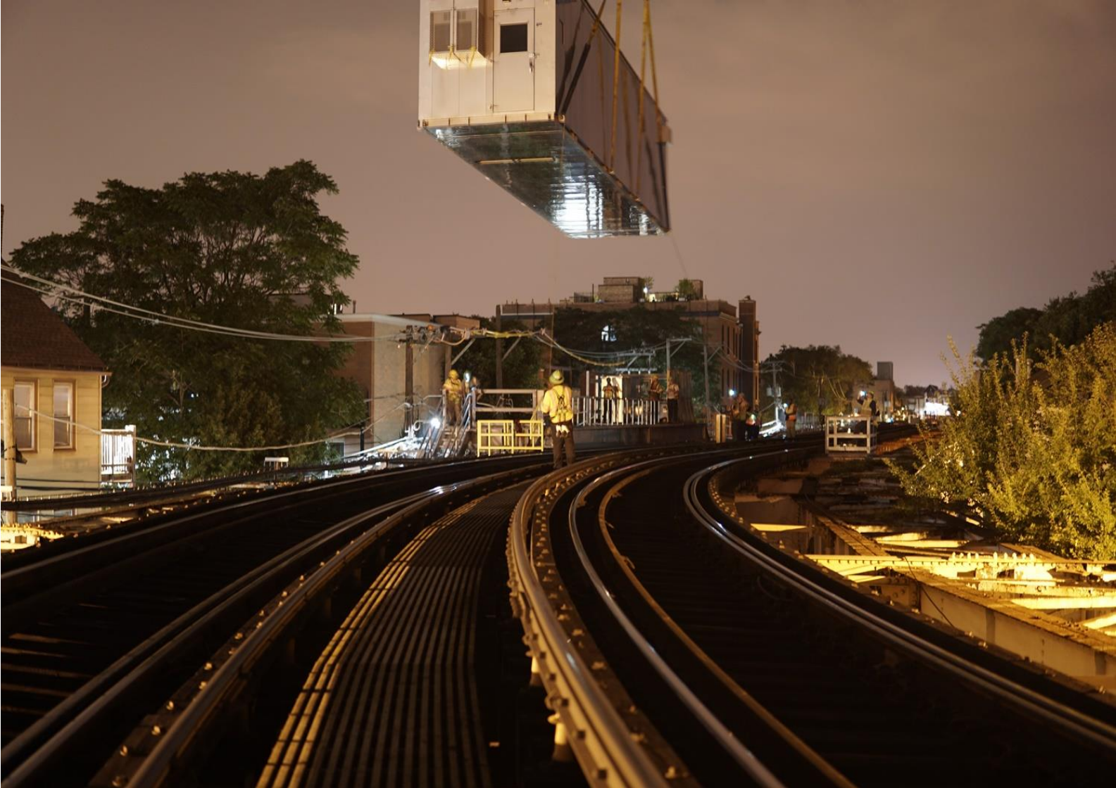
Setting of Willow Relay House