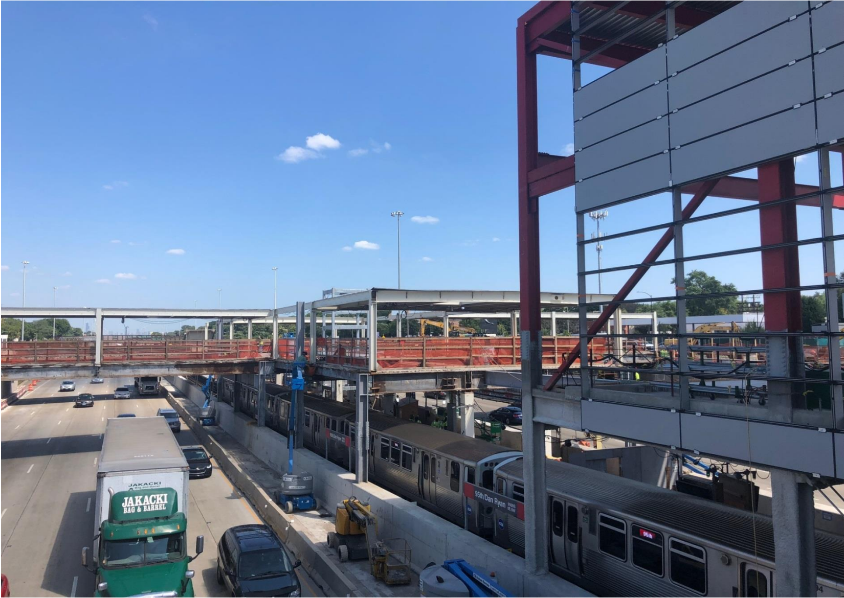
Curtainwall Framing and Panel Installation