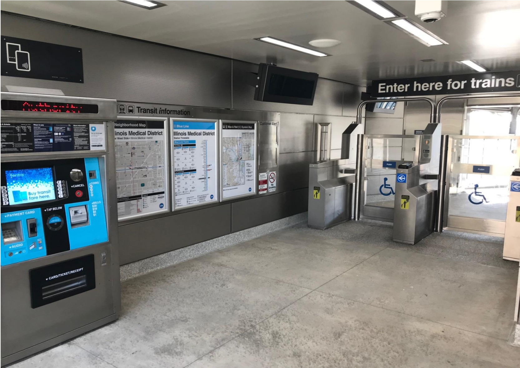
Paulina Station – Interior Completed