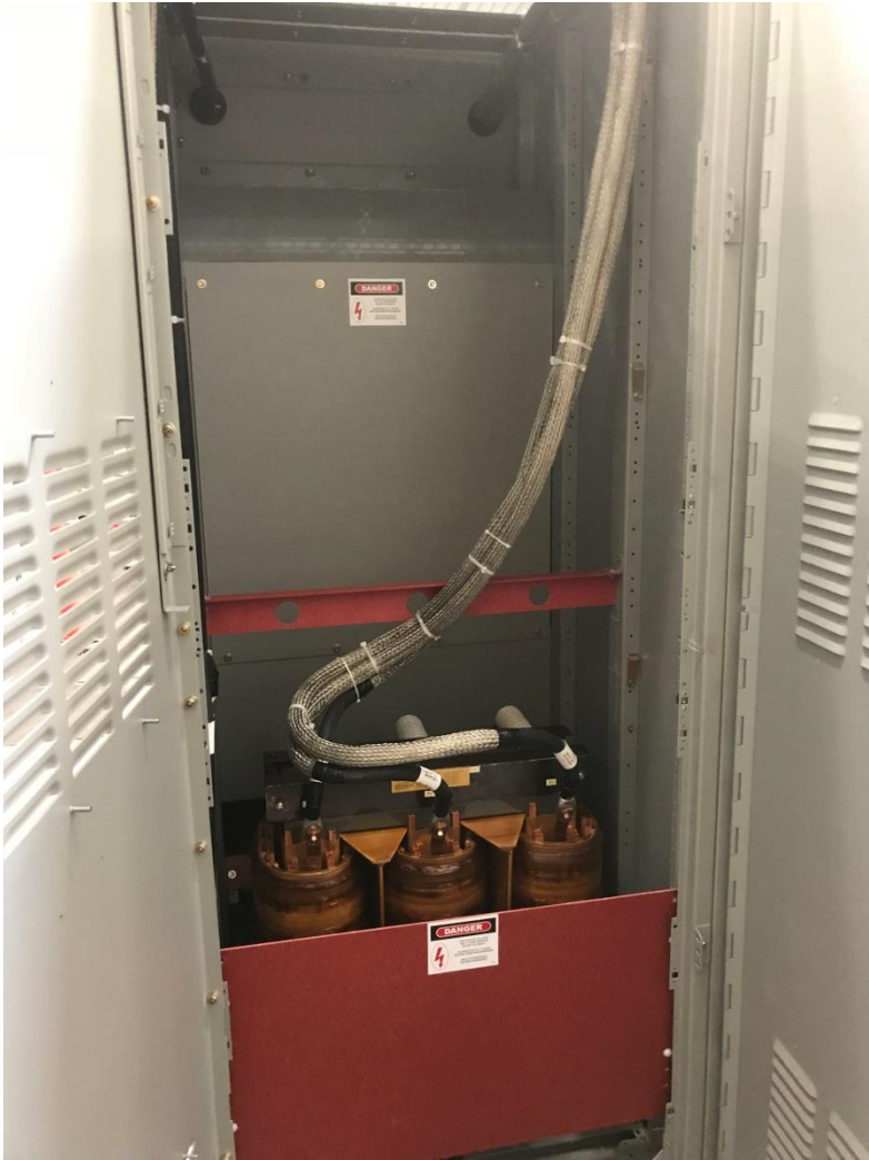
Cable Installation and Auxiliary Transformer Installation at Illinois Substation