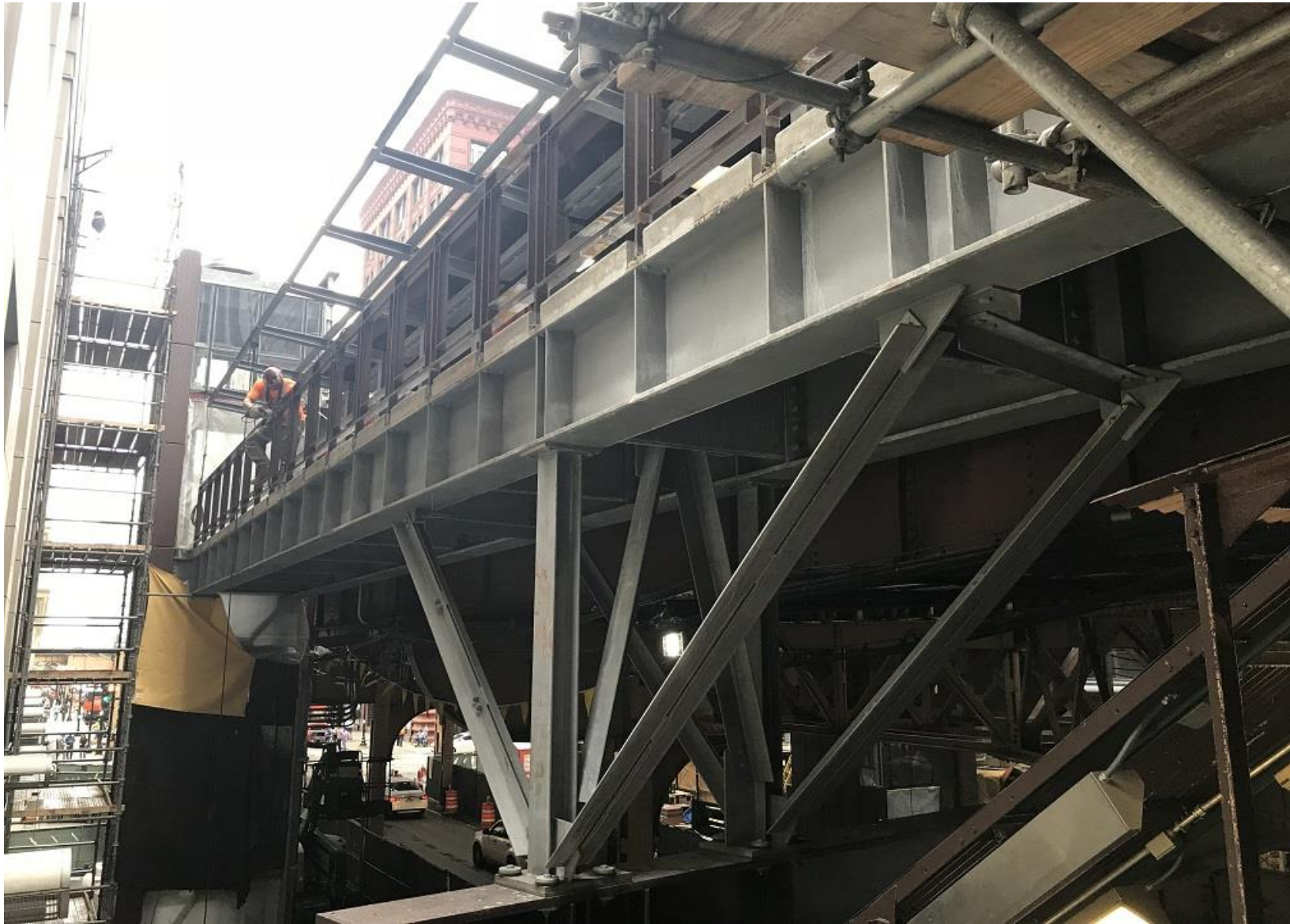
New Elevator Connection Bridge Build Out