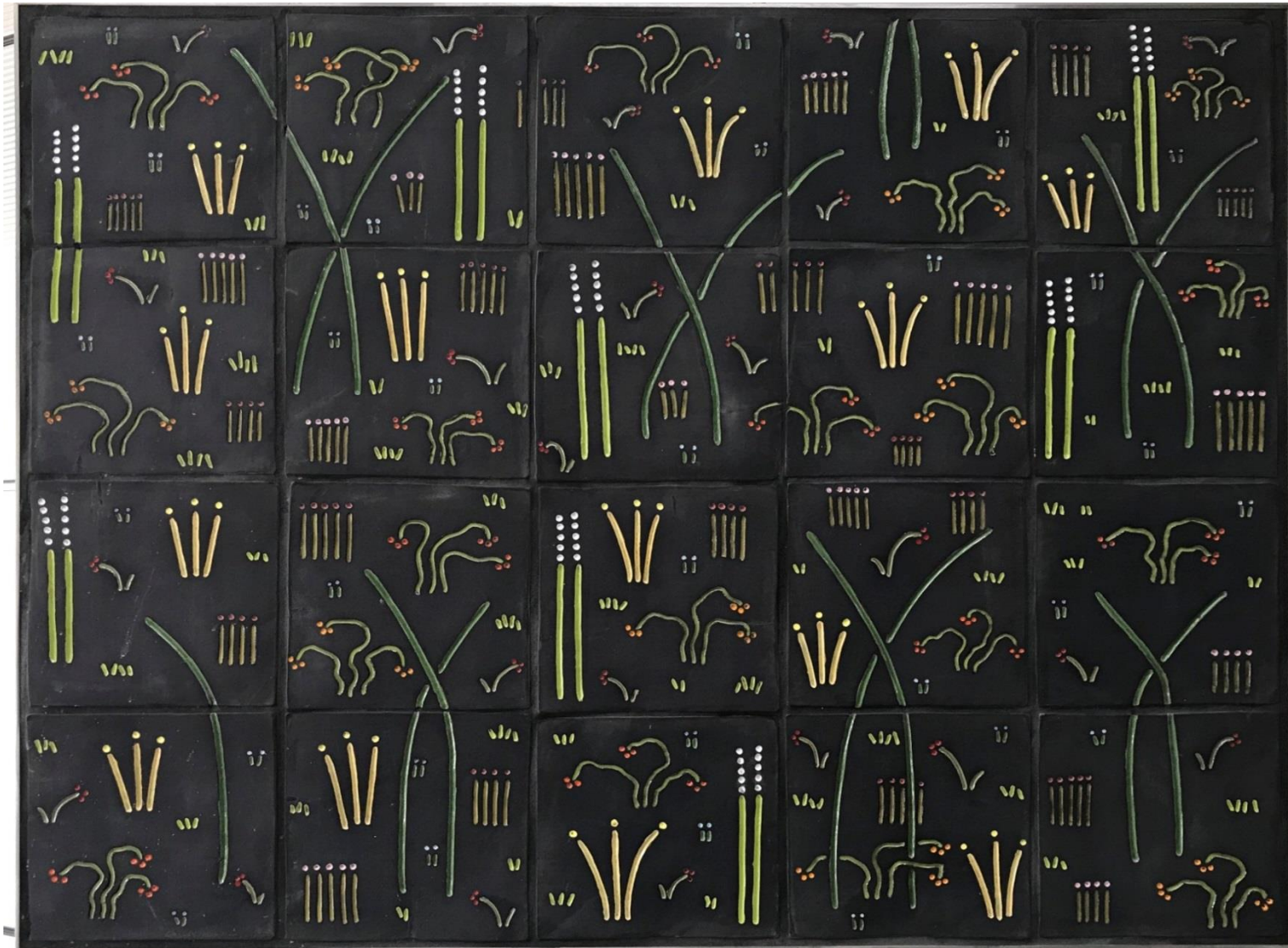
Paulina Station – Artwork