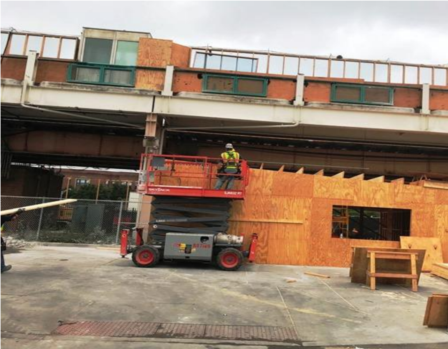
Building Temporary Fare Area