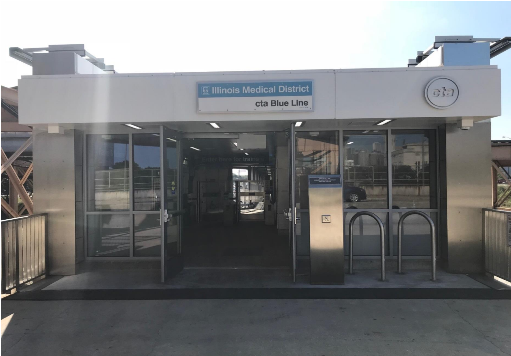
Paulina Station – Exterior