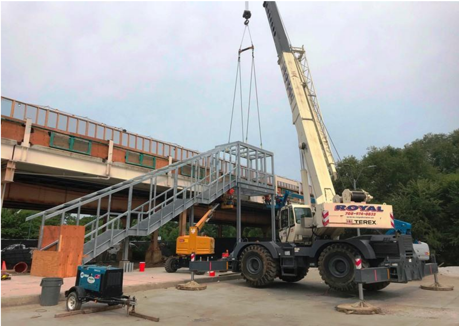
North Stairs Structural Steel Installation