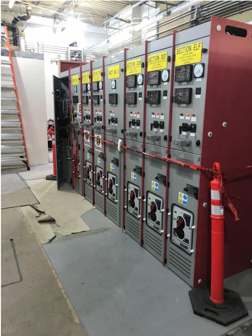
New DC Switchgear Installation at Milwaukee Substation