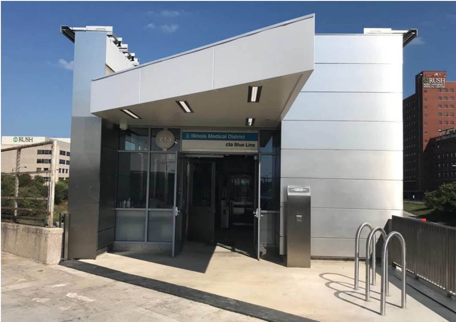
Ogden Station – Exterior