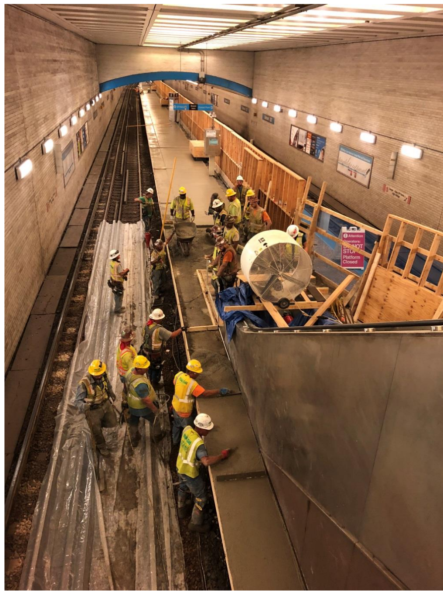
Installation of New Platform Topping at Belmont (Northbound)