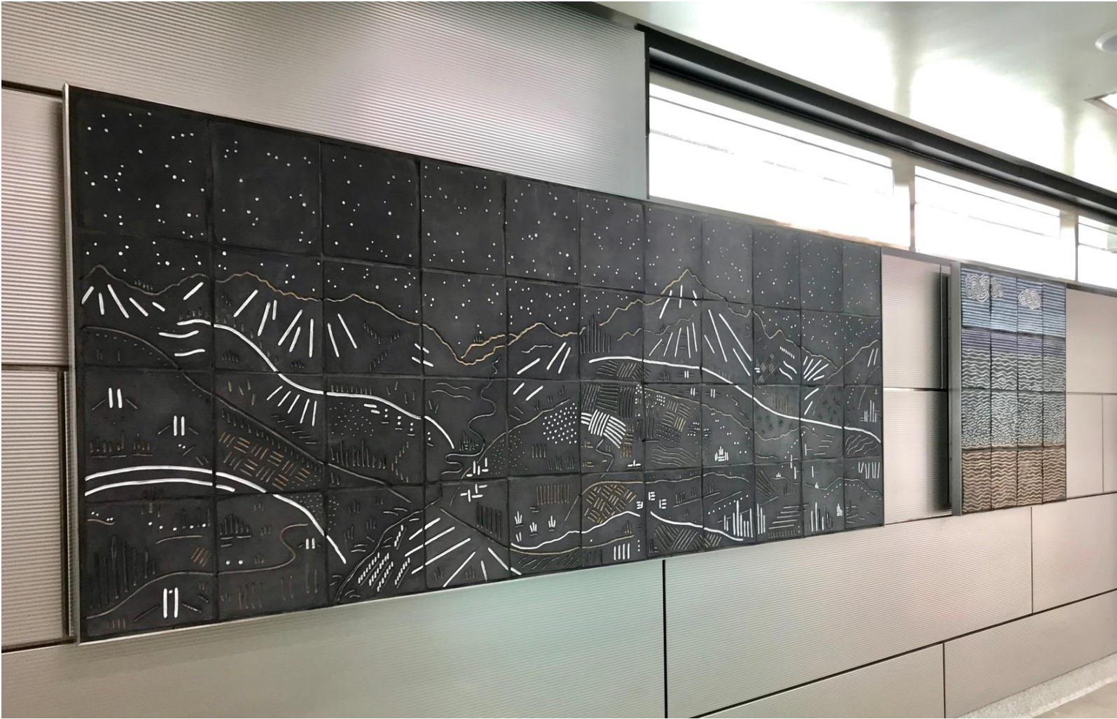
Ogden Station – Artwork