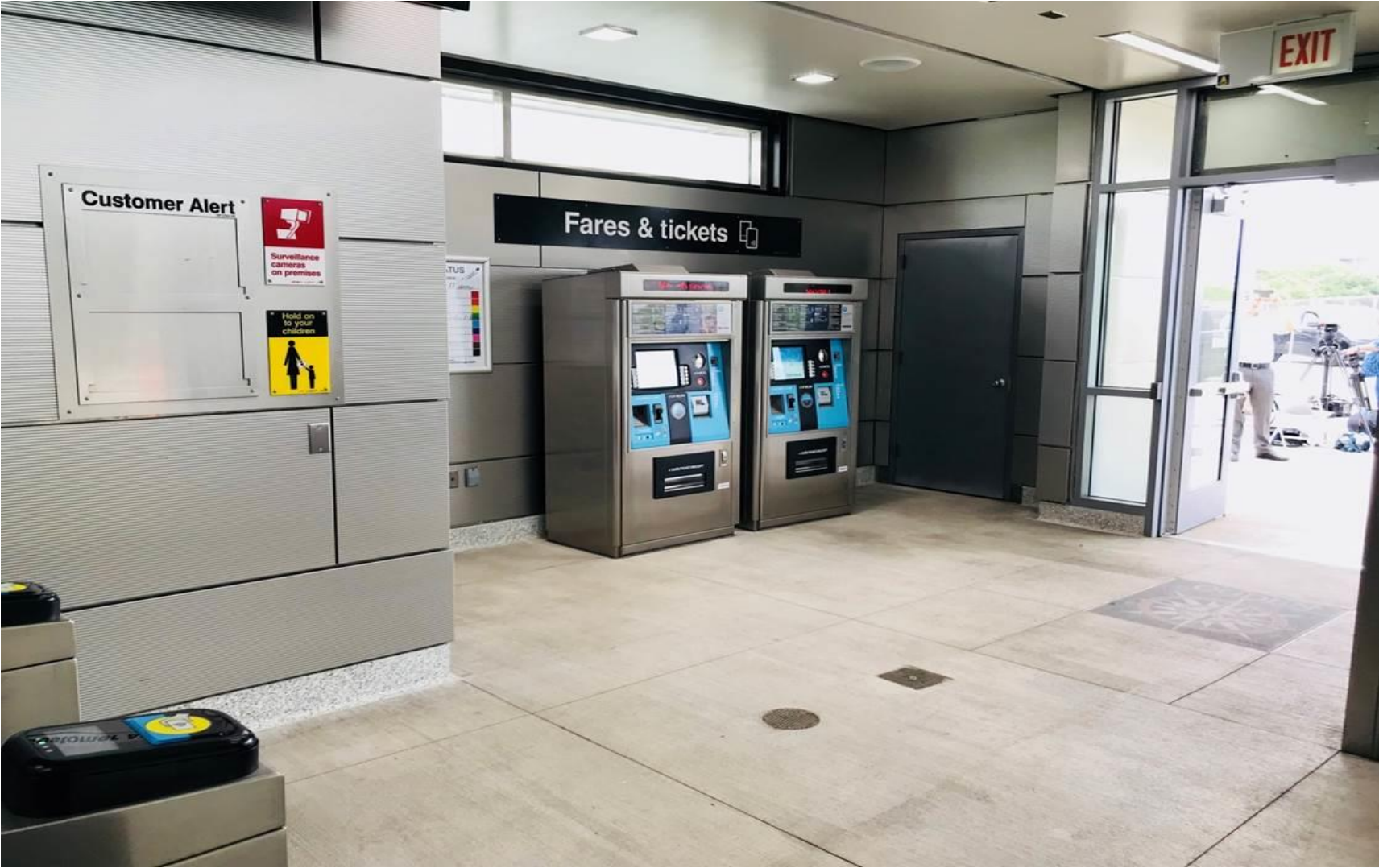
Ogden Station – Interior Completed