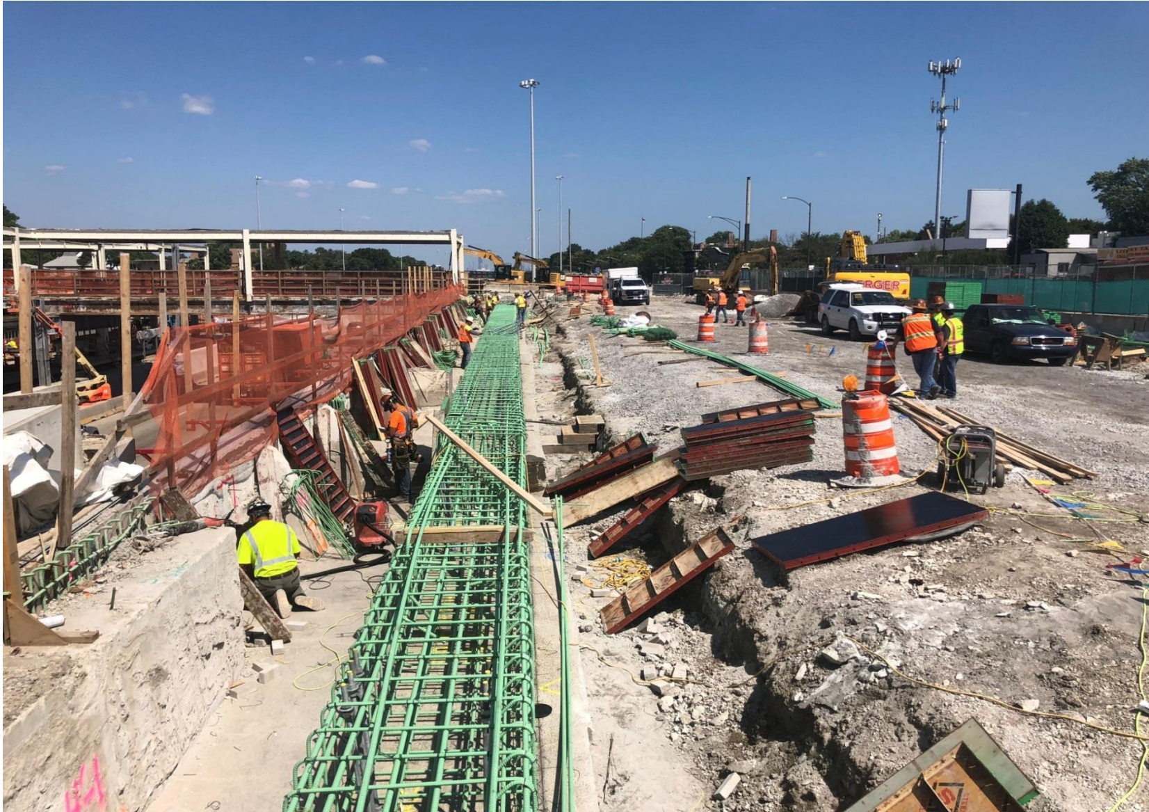
Bus Canopy Foundation Grade Beam Rebar Installation