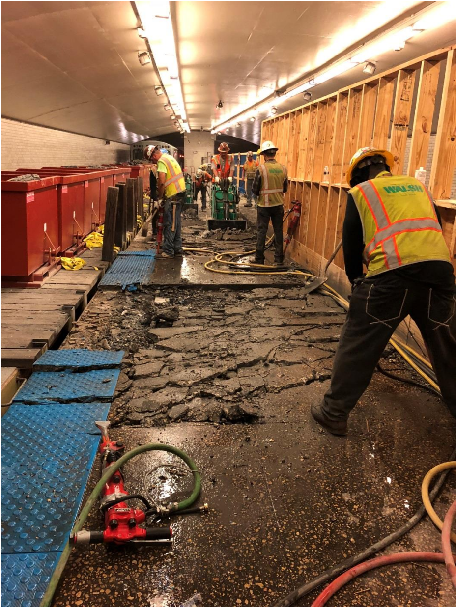
Demolition of Belmont Northbound Platform Topping