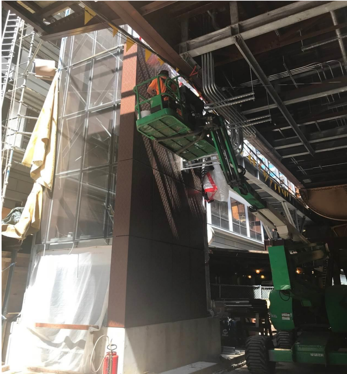
New Elevator Enclosure Panels Installation