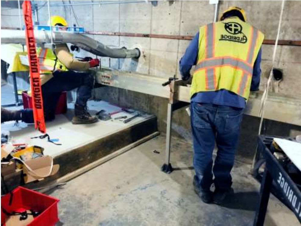
Electrical Work in the Cable Vault at Milwaukee Substation