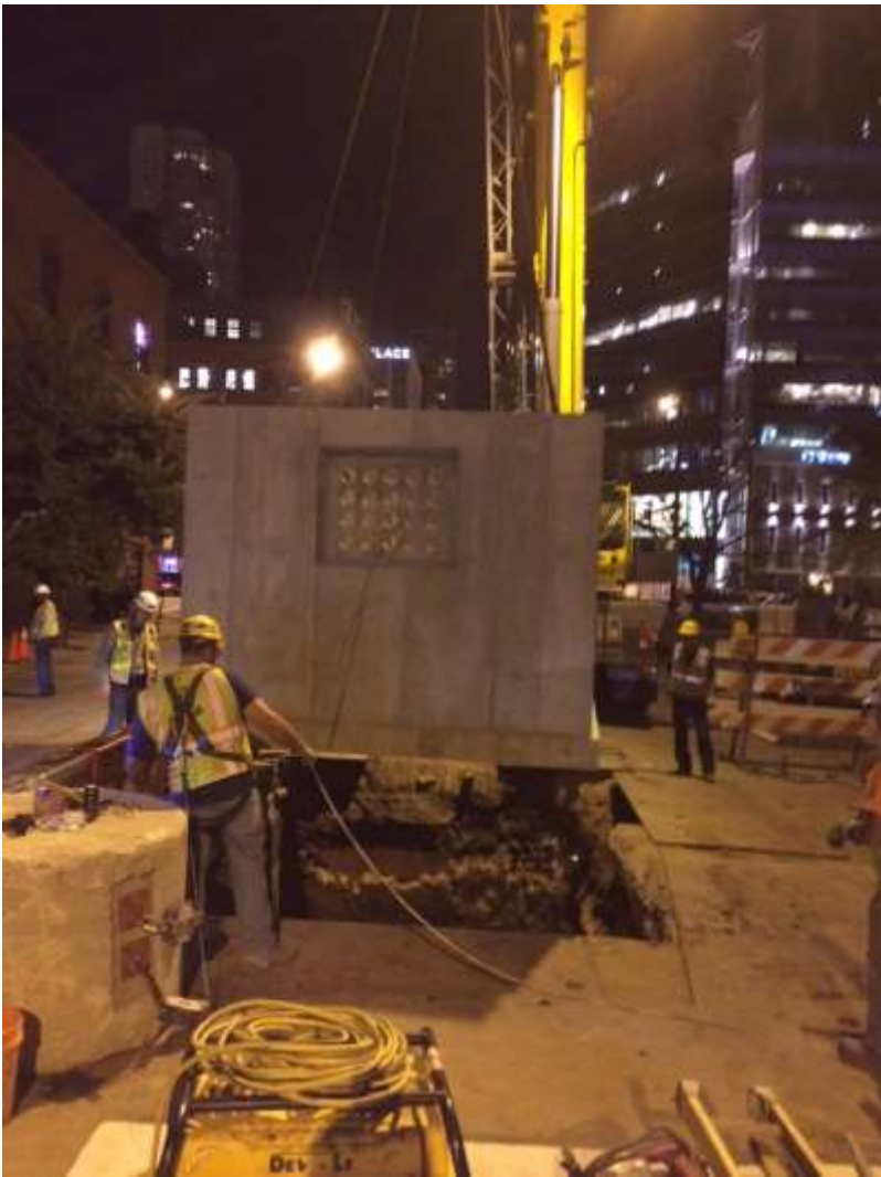
Manhole Installation at Illinois Substation