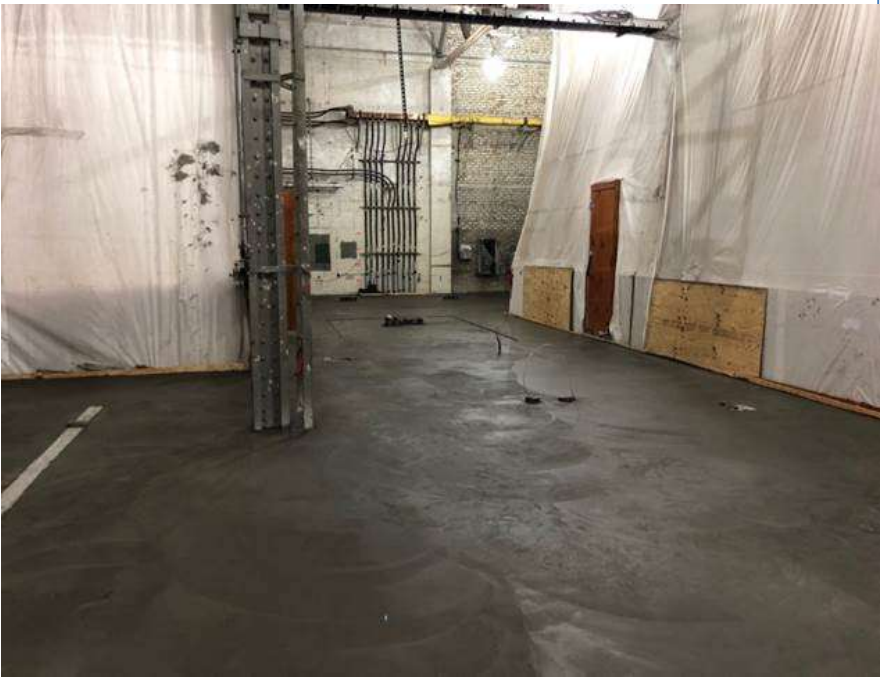
Rebar Installation and Concrete Pour at Broadway Substation