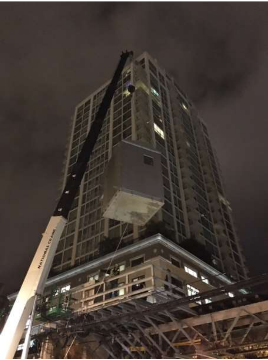
Installation of Huron Crossover Local Control Panel House