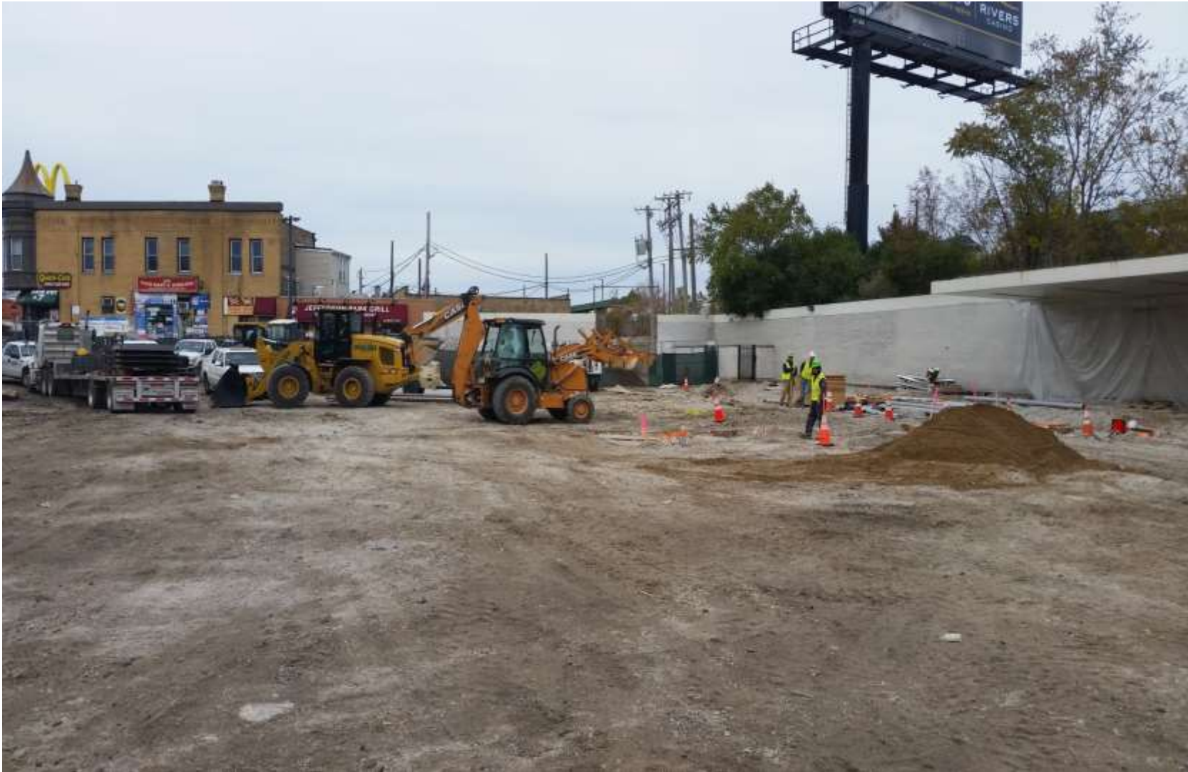
Site Work at Jefferson Park