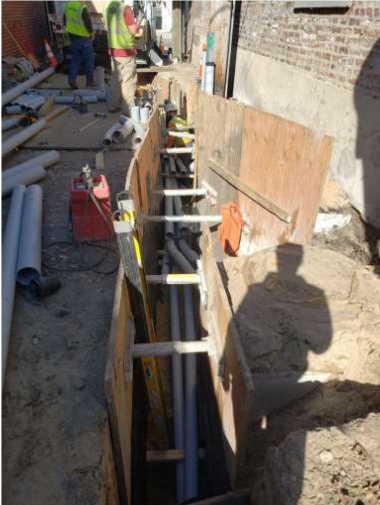
Transformer Hookup in Alley South of Winona (left) and Conduit Installation in Alley South of Berwyn (right)