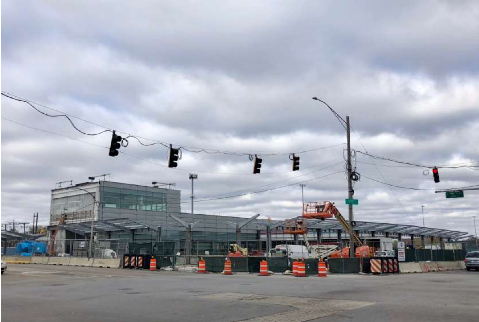
North Terminal Building – Looking from 95 th /State St.