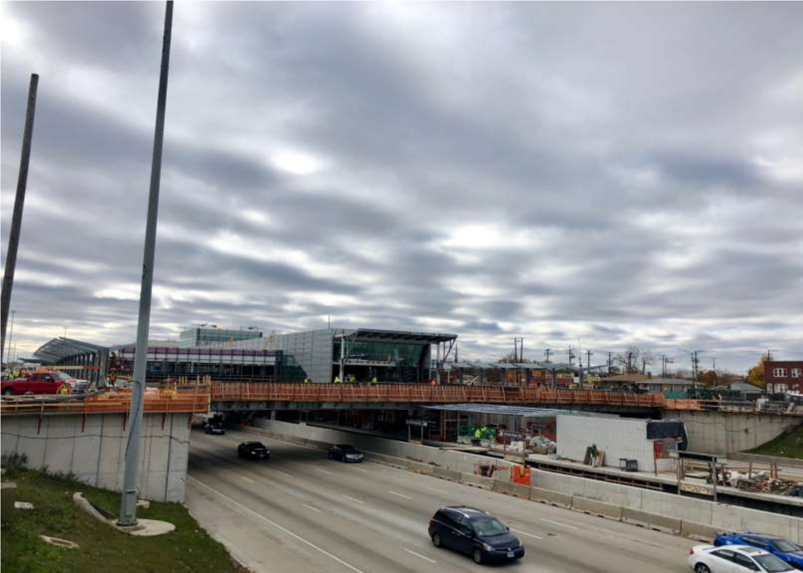
North Terminal North Prow – Looking South from State Street