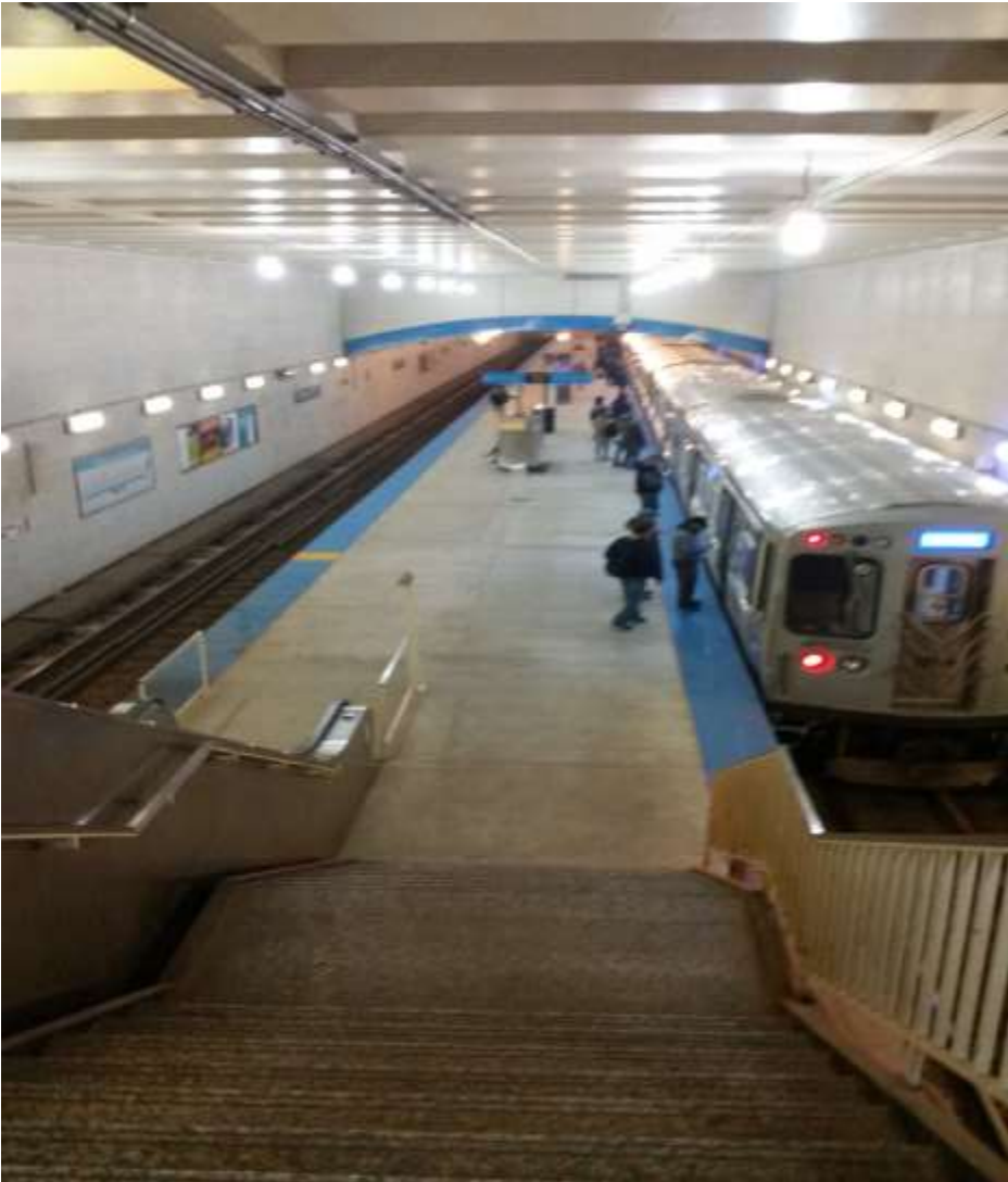
Belmont – Rail Platform