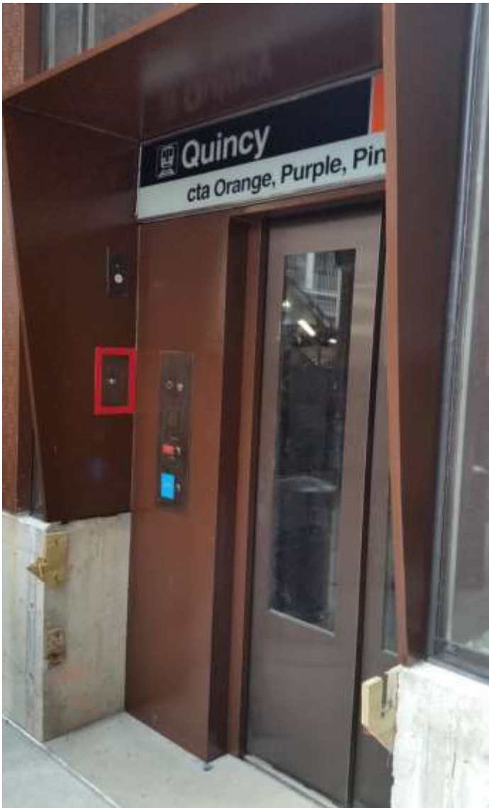
New East Elevator