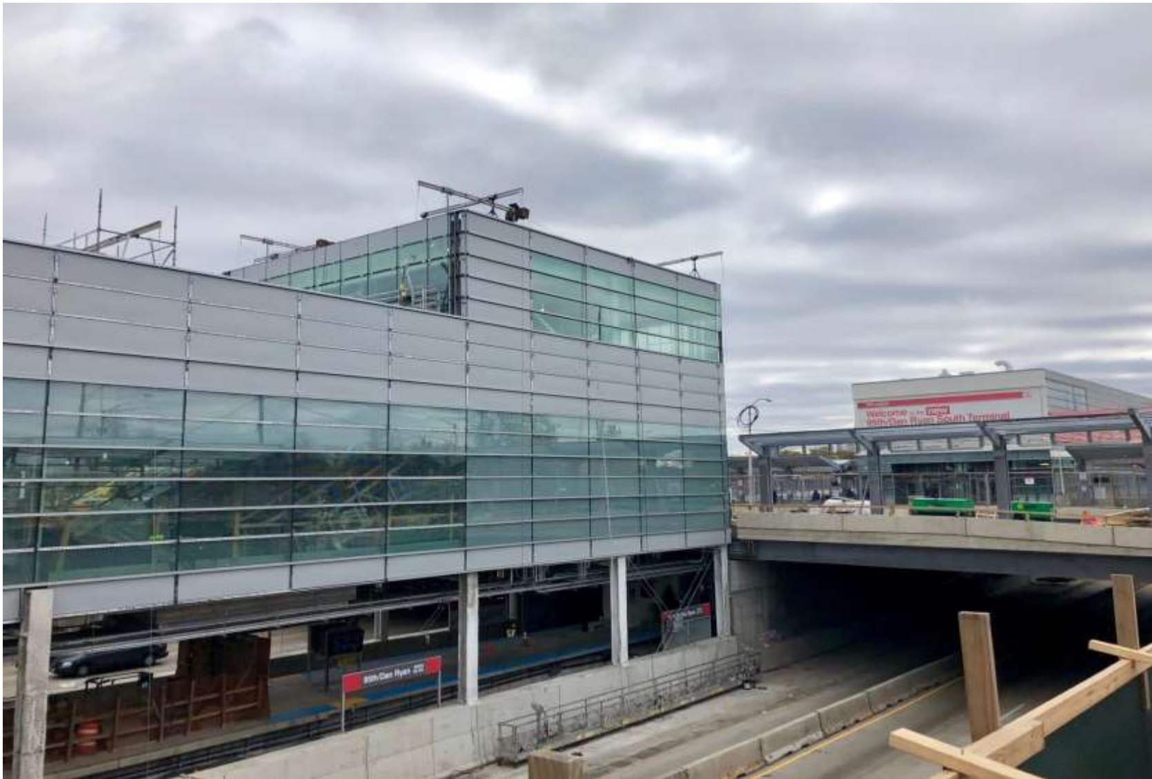
North Terminal Curtainwall / Metal Panel Installation