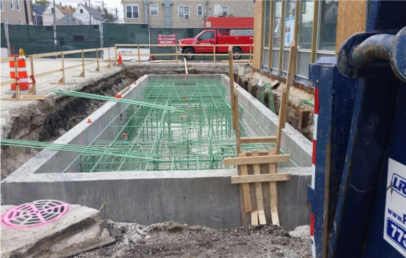
Belmont - Structural Support for the New Canopy