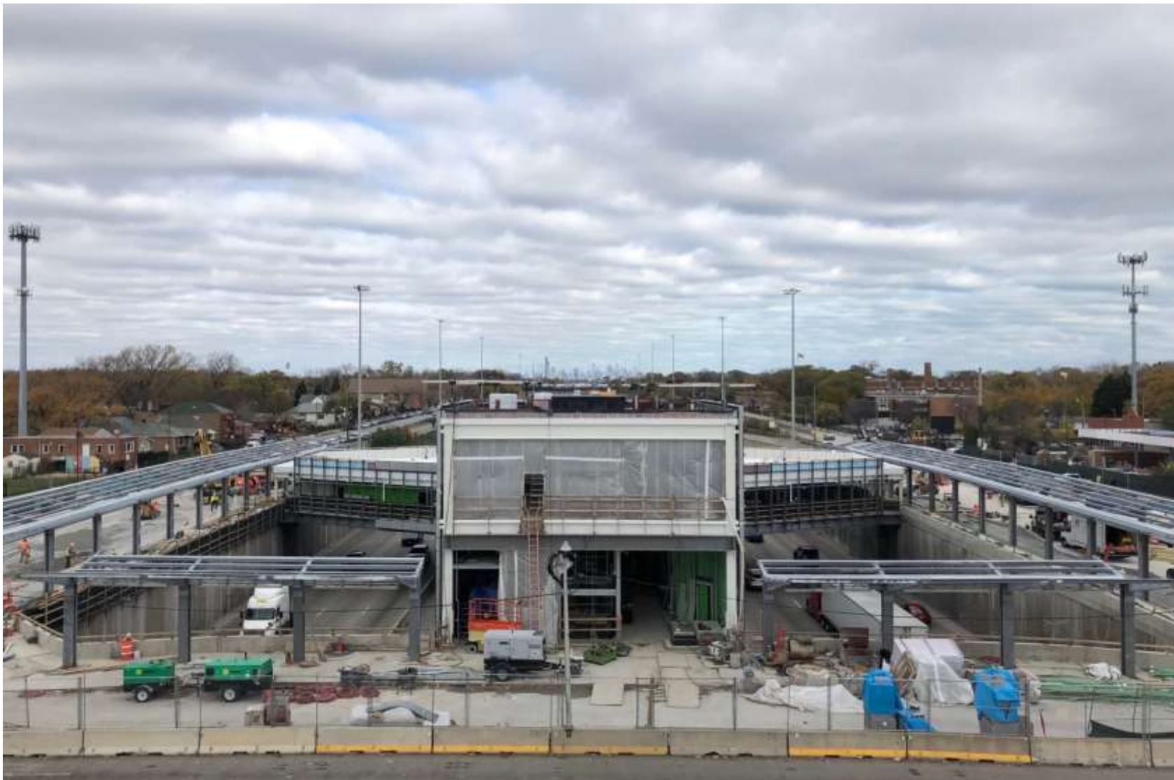
North Terminal Building – Looking North from ST Roof