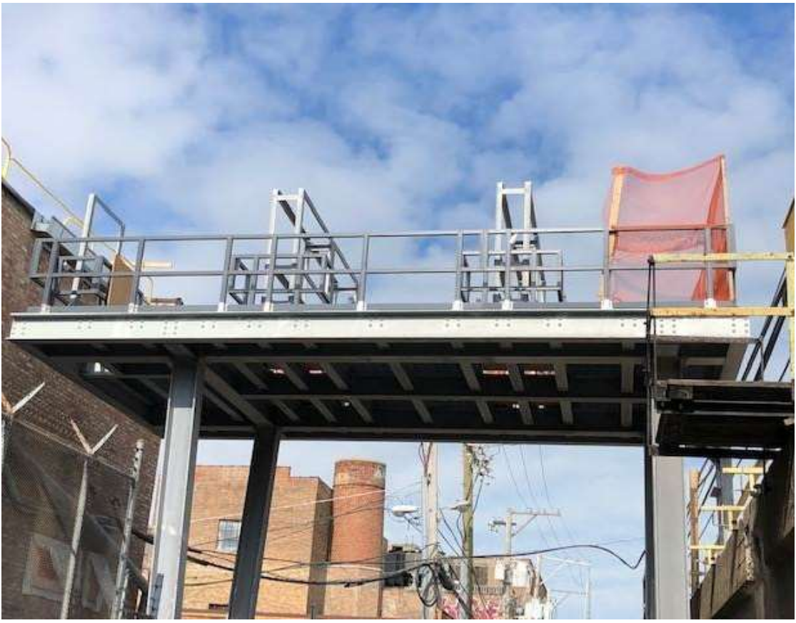
Cable Bridge Erection at Broadway Substation