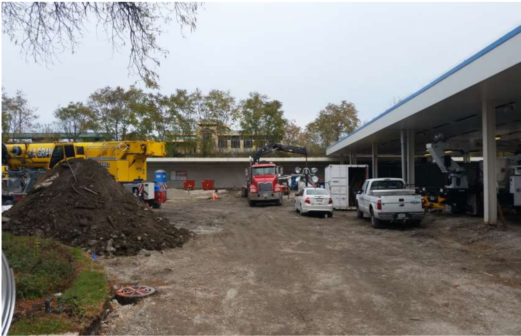
Site Work at Jefferson Park