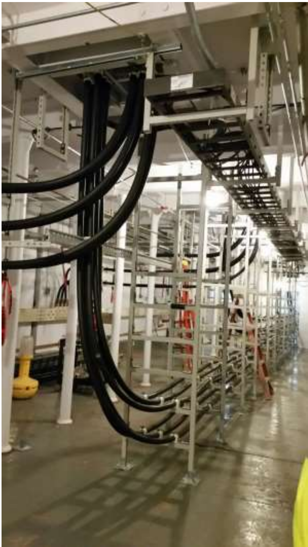
Traction Power Cable Installation at Illinois Substation