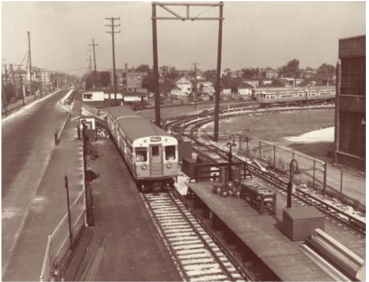
Some of the CTA's first 6000-series cars were in service on the Douglas Park branch when this photo was taken at the 54th Avenue terminal in 1954. Former 'L' right-of-way in the distance was still being prepared for new use after service was cut back from Oak Park Avenue two years earlier. From 1954 until 1958 Douglas Park trains completed trips downtown via the connector track to Lake, while Garfield Park trains operated partly at street level as construction continued in the median of the Congress (Eisenhower) Expressway.