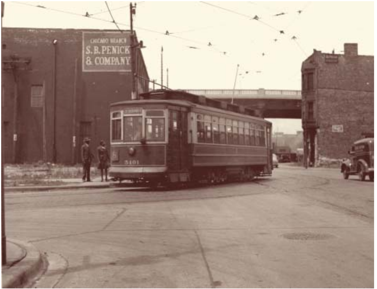
#8 Halsted cars never regularly operated on Crosby, so Car #5401 may have been on a detour for bridge work when this photo was taken looking west on Division toward Ogden (above) and Halsted (below) in the early 1940s. Among Chicago's first PAYE (Pay As You Enter) cars, #5401 was part of an order for 400 cars from J.G. Brill of Philadelphia in 1906-8. The first 50 cars in this group never made it to Chicago. They were diverted to San Francisco to help rebuild a fleet that was destroyed in the earthquake and fire of 1906.