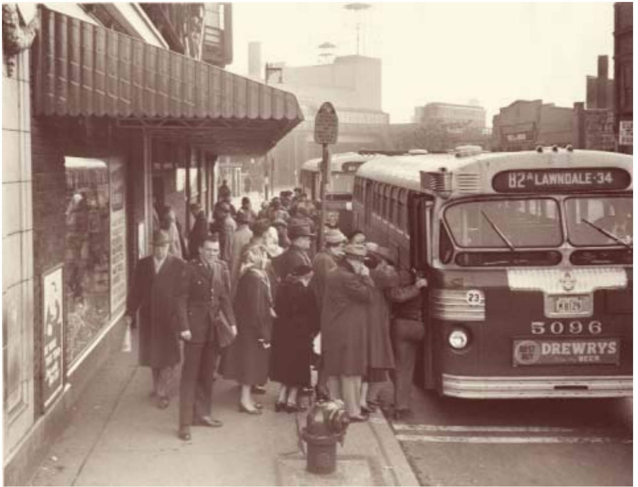
In this 1953 view looking east at the Logan Square terminal, customers boarding the #82A bus to Lawndale-34th were probably transferring from Kimball service that operated south from McCormick and Lincoln, since 'L' passengers would have come from the same general direction the bus was heading. Bus #5096 had seats for 51 passengers and was among the first 500 propane buses purchased from Flixible in 1950-51. After 'L' service was extended to Jefferson Park in 1970, the terminal was removed and Logan Square became a subway stop.