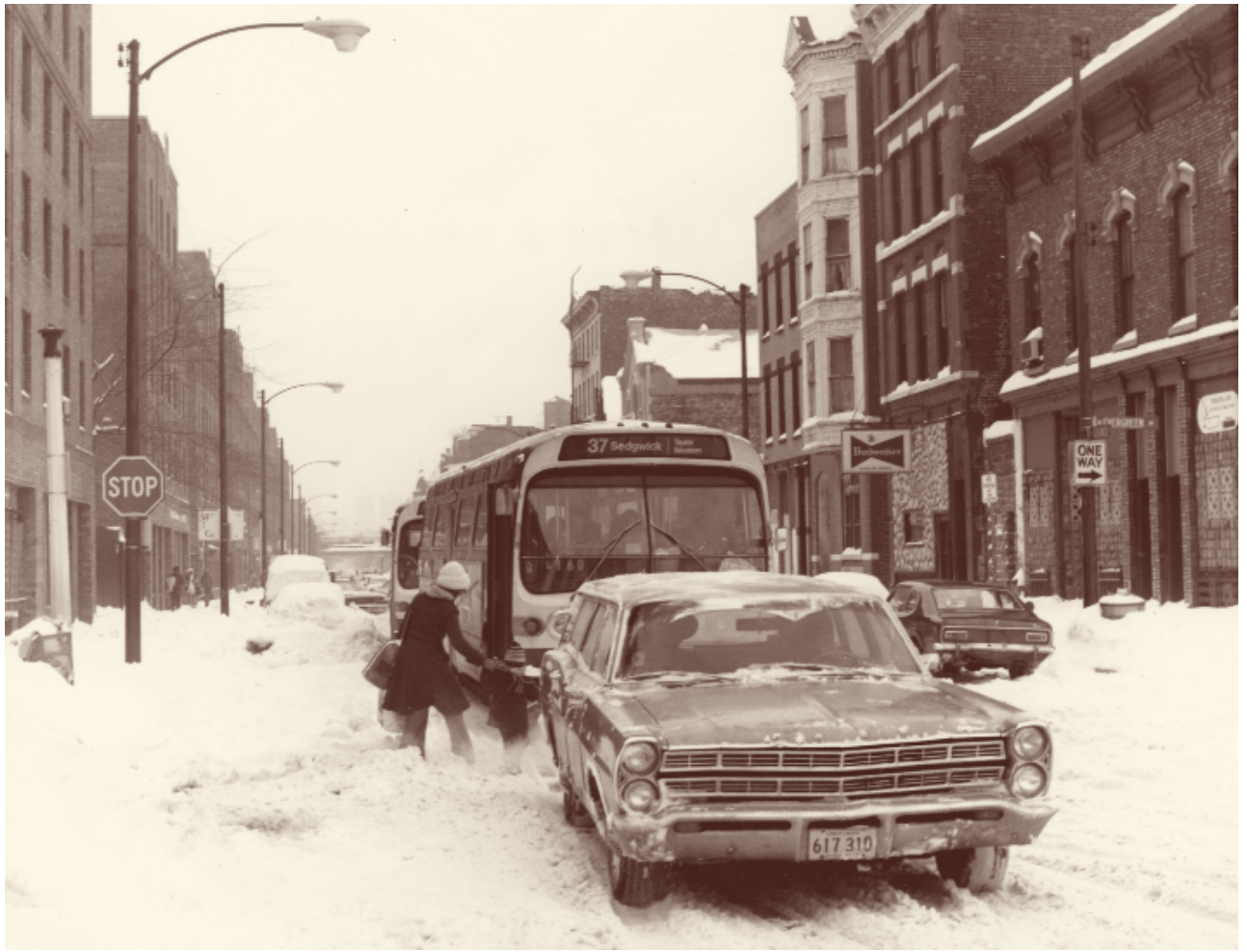
In this January 1979 view, looking north on Sedgwick, a customer leads her child toward a #37 Sedgwick bus southbound at Evergreen as another follows directly behind. Both were GMs with air-conditioning purchased in 1972 and assigned to the Limits garage. At the time, #37 buses operated west only to Taylor/Western, since the #58 Ogden route served Ogden all the way to Pulaski from Michigan Avenue downtown via Randolph and Ogden.