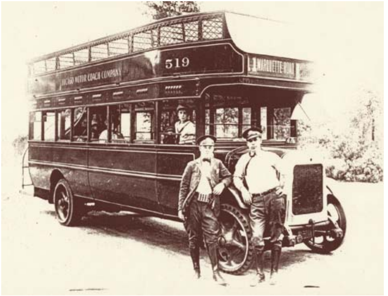
An operator and conductor pose before a trip on one of 70 open-top double-deckers, which the Chicago Motor Coach Company purchased from Yellow Coach for service on its "Boulevard Routes" in 1923-24. The #11 Marquette route originally linked Marquette Park with Jackson Park, but service east of Loomis was discontinued in 1942 when buses began operating directly downtown, making limited stops via Loomis to Garfield and then merging with Garfield service via Michigan, Lake and Wabash to Wacker/Michigan.