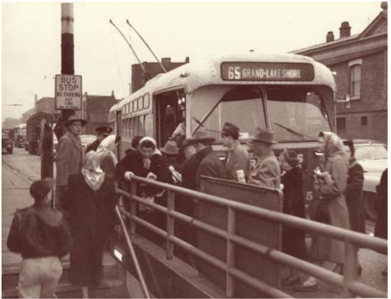
Morning rush period commuters apparently transferring from Milwaukee or Halsted buses were in such a hurry to catch this eastbound #65 bus that they crossed Grand between cars rather than at the stoplight. A collector tries to assist the boarding process in this 1960s view looking west. The 10½-mile trip this Marmon-Herrington bus was taking from Nordica to Lake Shore made Grand one of the longest trolley bus routes in the CTA system. Trolley buses operated on Grand from 1951 until all trolley service ended in 1973.