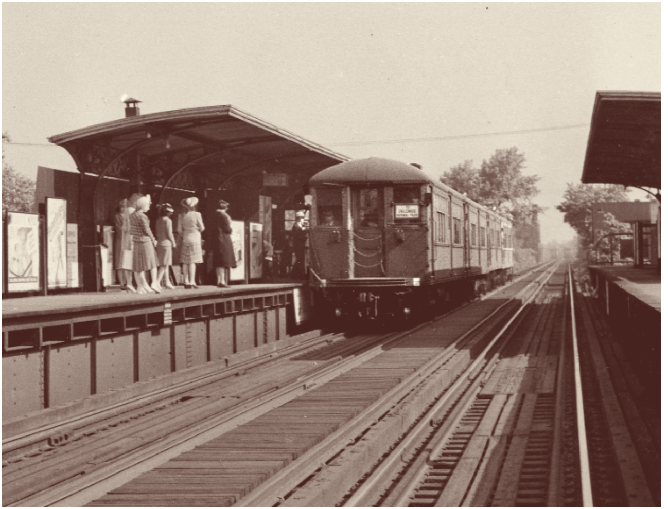
From 1913 until 1949, Ravenswood trains operated from Kimball to the South Side, first to Kenwood and later to Englewood/Normal Park. In this early 1940s view, a Ravenswood train of 4000-series cars with middle doors that never opened stops southbound at Irving Park on a trip to Englewood. At that time, the last car was detached at Harvard for service on the Normal Park branch, where stops were made at 65th, Marquette and the terminal at 69th. Shuttles later served Normal Park from Harvard until the branch was discontinued in 1954.