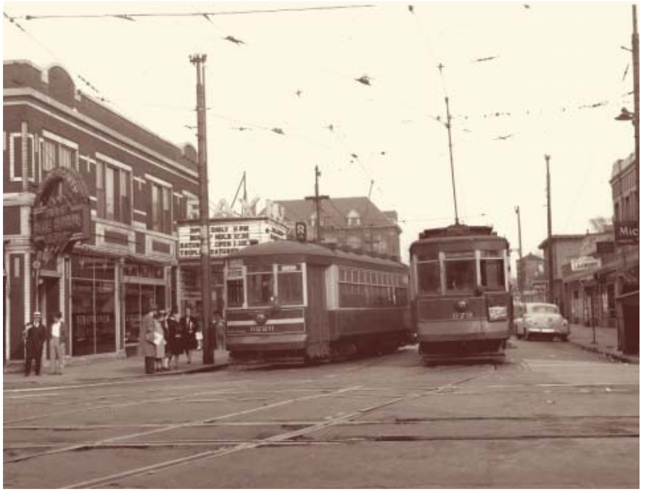
Streetcars as well as South Chicago branch Illinois Central trains operated through the intersection of 75th and Exchange when this photo was taken looking east in the mid-1940s. Preparing to turn north onto Exchange is a one-man car built by the Lightweight Noiseless Streetcar Company that was winding its way along the South Deering route from Torrence/112th to Dorchester/63rd. Heading east to the terminal at 75th and the lakefront is an "Old Pullman" on the 74th/75th route that had already seen almost 40 years of service.