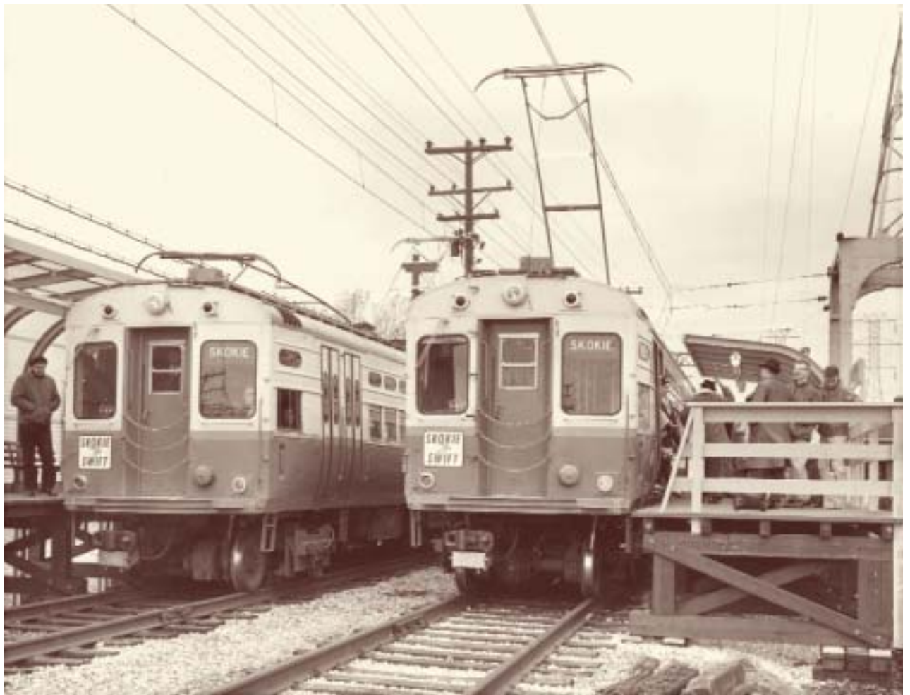
Just before the official inauguration of "Skokie Swift" service on April 18, 1964, customers were treated to free rides on the new express operation from Howard to Dempster/Skokie. Double-ended, 1-50 series cars from the St. Louis Car Company were used for the service, which required pantographs for overhead power west of Skokie Shops. These cars operated for almost 30 years until they were replaced by 3200-series cars from Morrison-Knudsen.