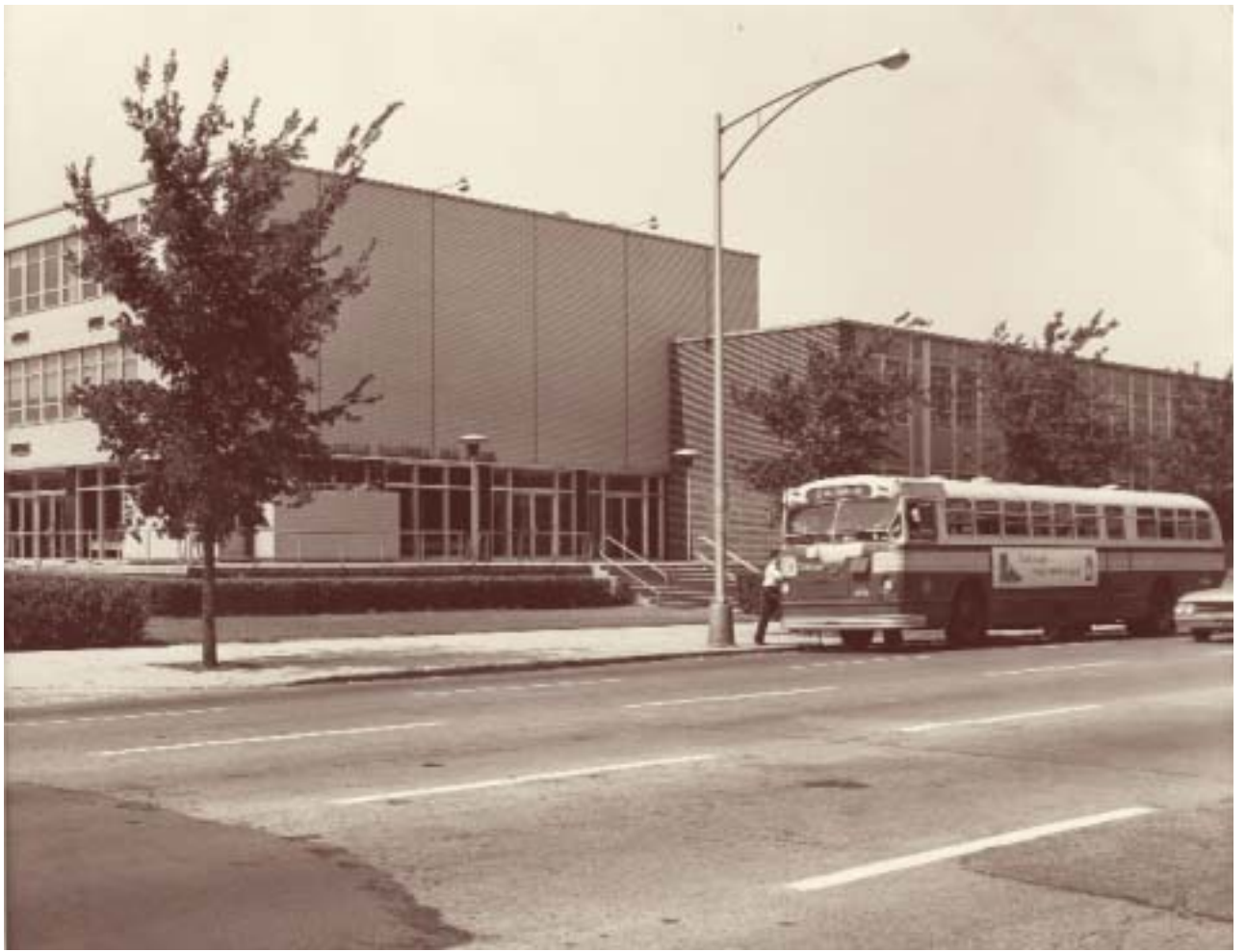
One of several boulevard routes taken over by the CTA from the Chicago Motor Coach Company in 1952, #3 South Park (now King Drive) buses for many years made short turns at 30th Street, which was convenient to Michael Reese Hospital. In this 1961 view in front of Dunbar Vocational High School, one of 481 50-seat propane buses purchased in 1953-55 waits to start a trip south to 81st while still showing the northbound short-turn destination sign. Service was extended south to 95th Street in 1972 and north to Chicago in 1988.