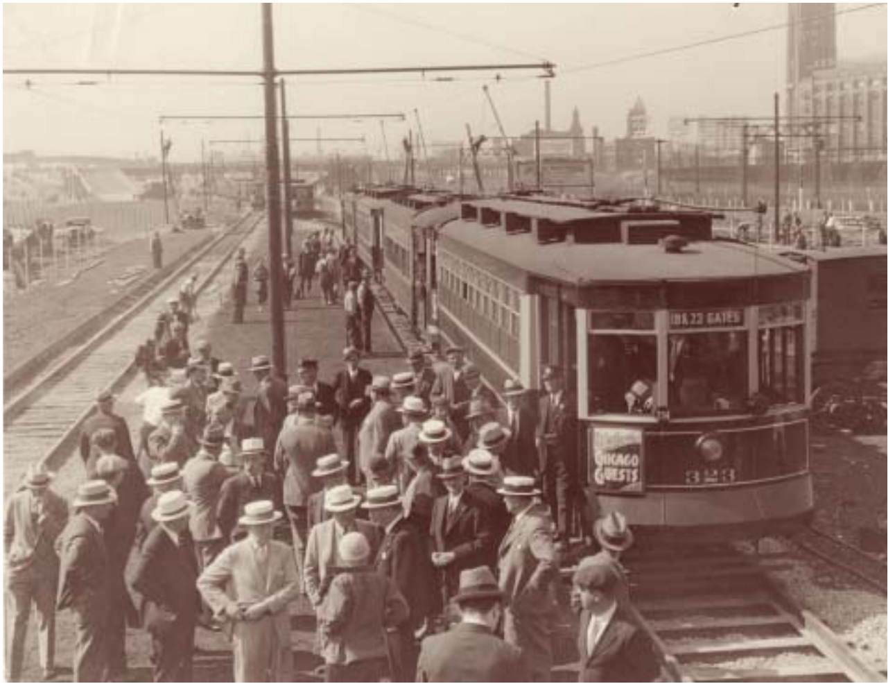
Service to the lakefront site of the Century of Progress World's Fair in 1933-34 involved extending streetcar lines over Illinois Central Railroad tracks at both Roosevelt Road and 23rd Street. In this view looking south, "Old Pullman" Car #323 has just delivered special guests to a new terminal near the south end of Soldier Field. The service ran east from Wabash on Cermak, which had recently been renamed from 22nd Street to honor Mayor Anton Cermak, and then via Silverton Way, the 23rd Street viaduct and a private right-of-way to the terminal.