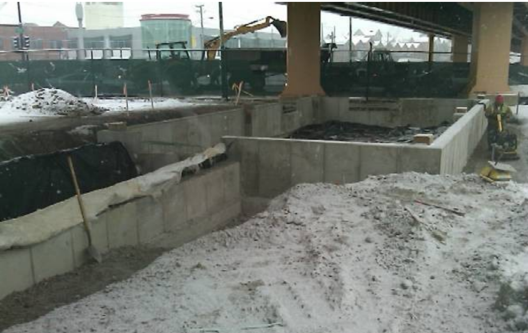
Progress on Archer stationhouse.