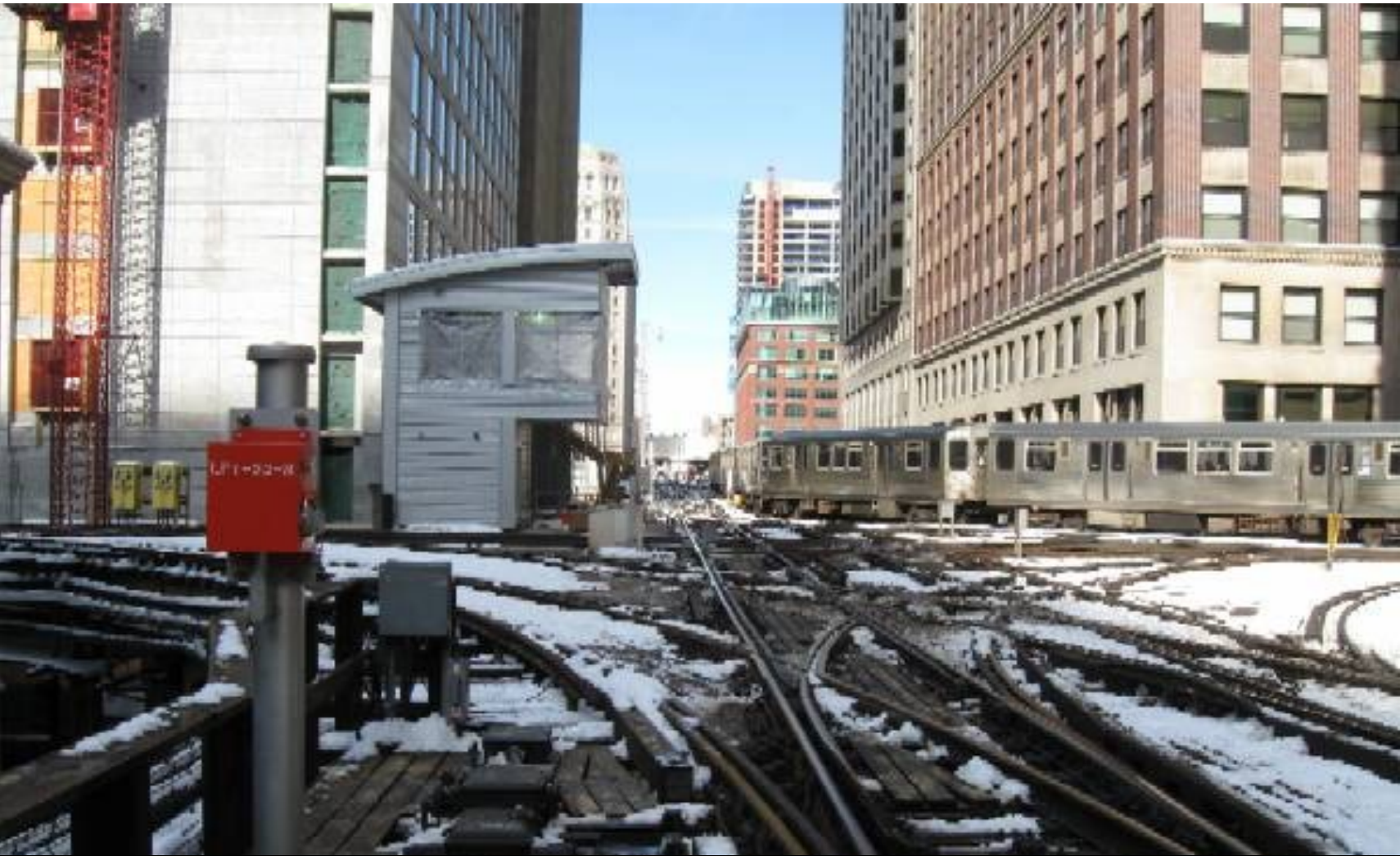
February 11, 2010 – New Tower 18 as seen leaving Washington/Wells station, looking north.