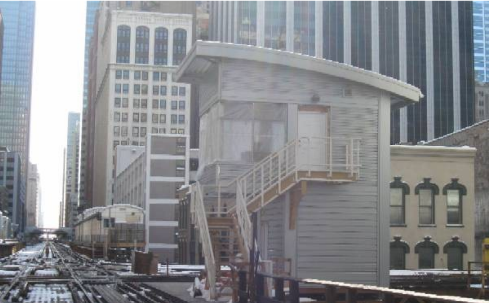
February 11, 2010 – New Tower 18 as seen from the Wells Street approach to the Loop, looking south.