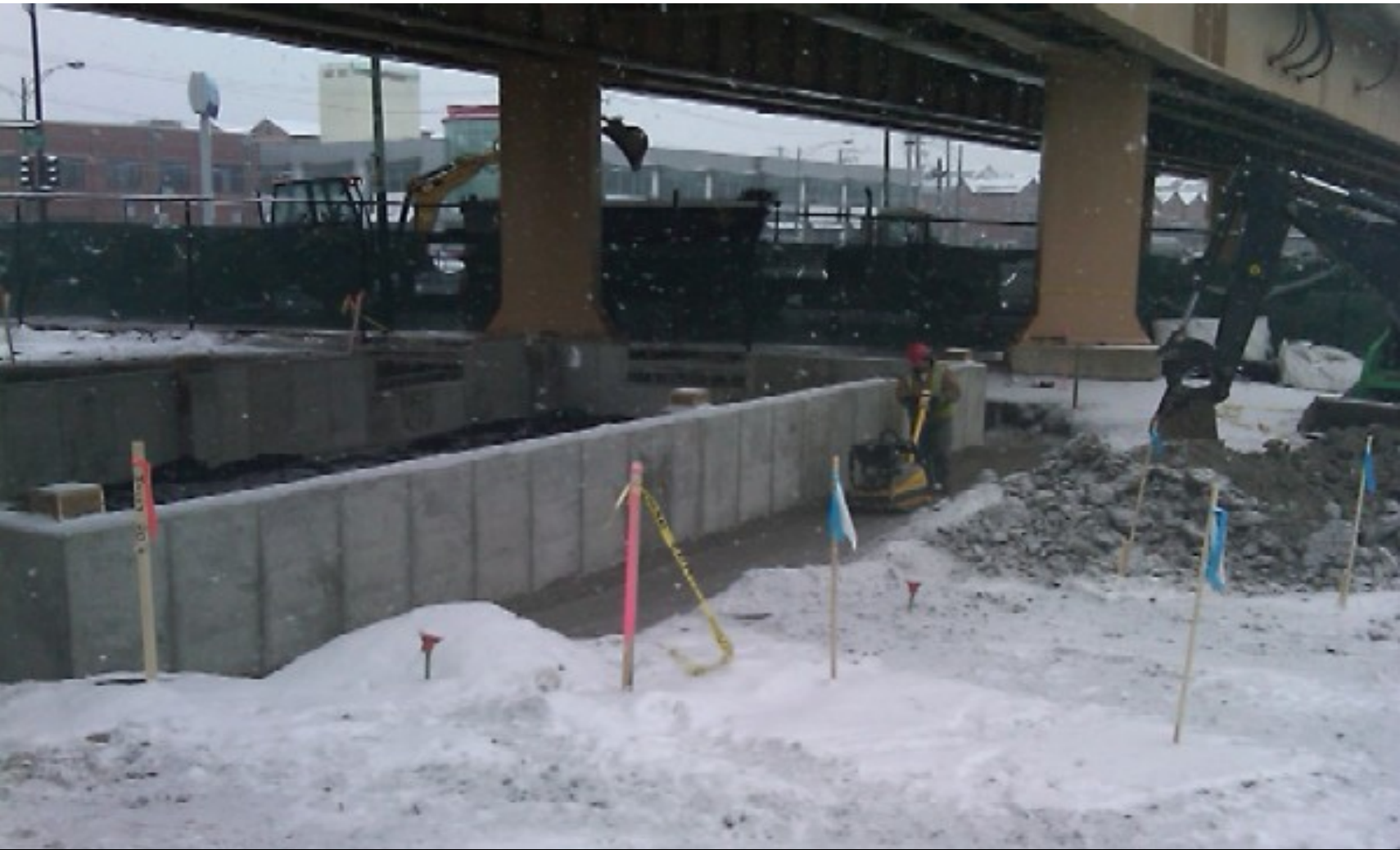
Progress on Archer stationhouse. Concrete being poured and utility relocation in the background.