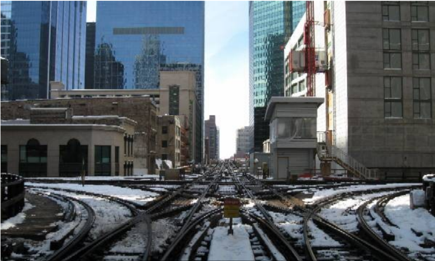
February 11, 2010 – New Tower 18 as seen leaving Clark/Lake, looking west