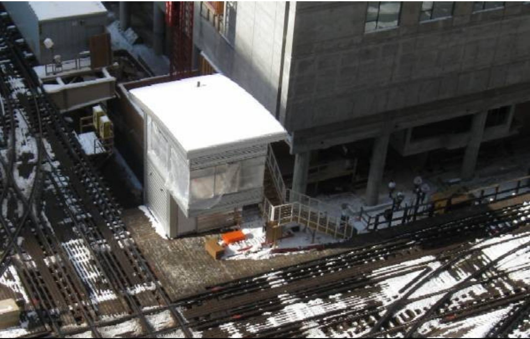
February 11, 2010 – New Tower 18 aerial view.